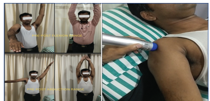
[Table/Fig-3]: Pre- and post-treatment ROM difference.

NPRS: Numerical pain rating scale; SPADI: Shoulder pain and disability index